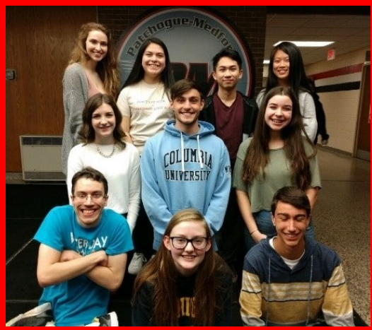
Class of 2018 Top Ten Students