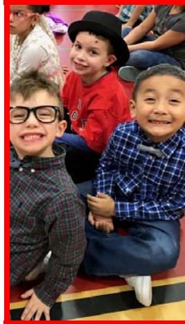
Canaan Kindergarteners at their 100 th Day of School Celebration (left). Pictured right, Bay students were recognized for showing respect at a red carpet ceremony.