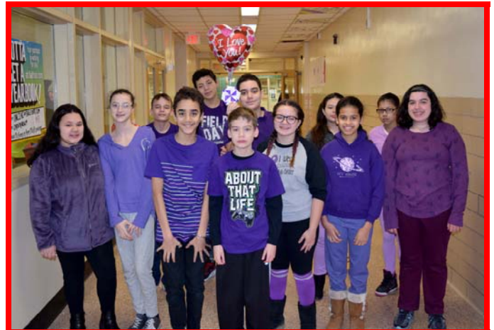
Saxton students wore purple for "PS I Love You Day" in order to spread love, decrease bullying and promote mental health awareness.