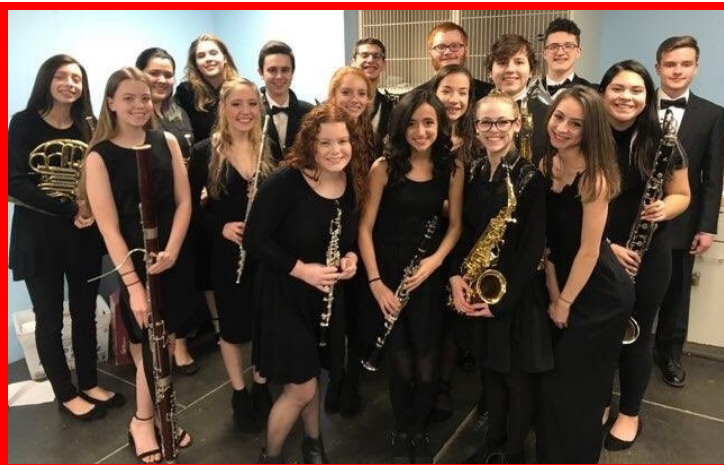
Patchogue-Medford High School's representation at the Mid Island Honors Band Concert.